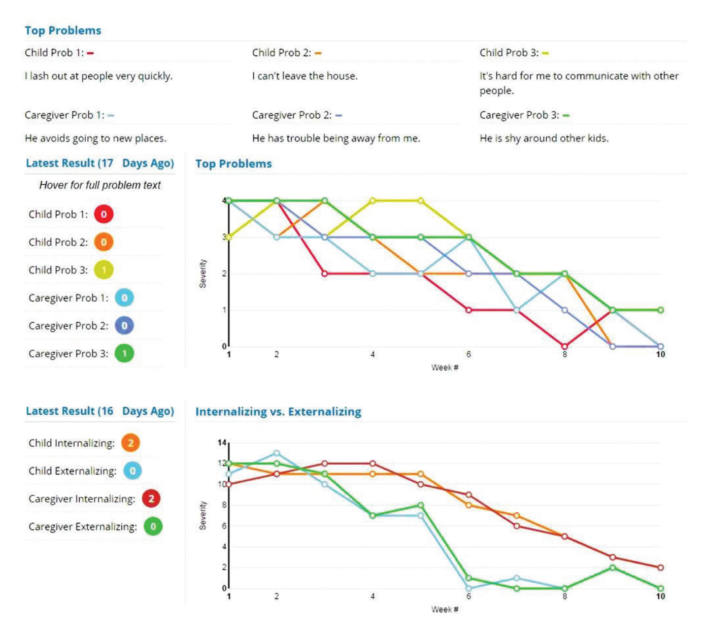
FIGURE 29.1. Measurement feedback system client dashboard used to inform clinician decision making for a youth who presented with anxiety and conduct problems at pretreatment. The dashboard displays weekly caregiver- and youth-report ratings of informant-identified "top problems" and of a standardized measure of internalizing and externalizing problems throughout the 10-week treatment.