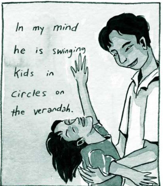
FIGURE 21.5. Page from Emily Thiessen's CBR project, Drawing Ethnography .

A few weeks after I arrive back in Canada my cousin sends us a message saying Stewart died in a car crash.