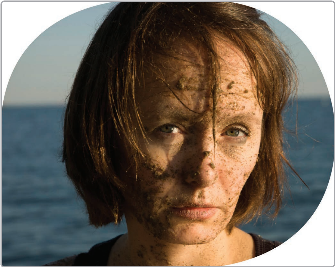
FIGURE 28.2. Photography and reflexivity.