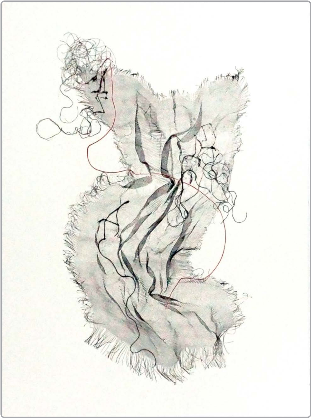
FIGURE 33.4. Michelle, Trace, No. 3 , 2014. Paper, ink.