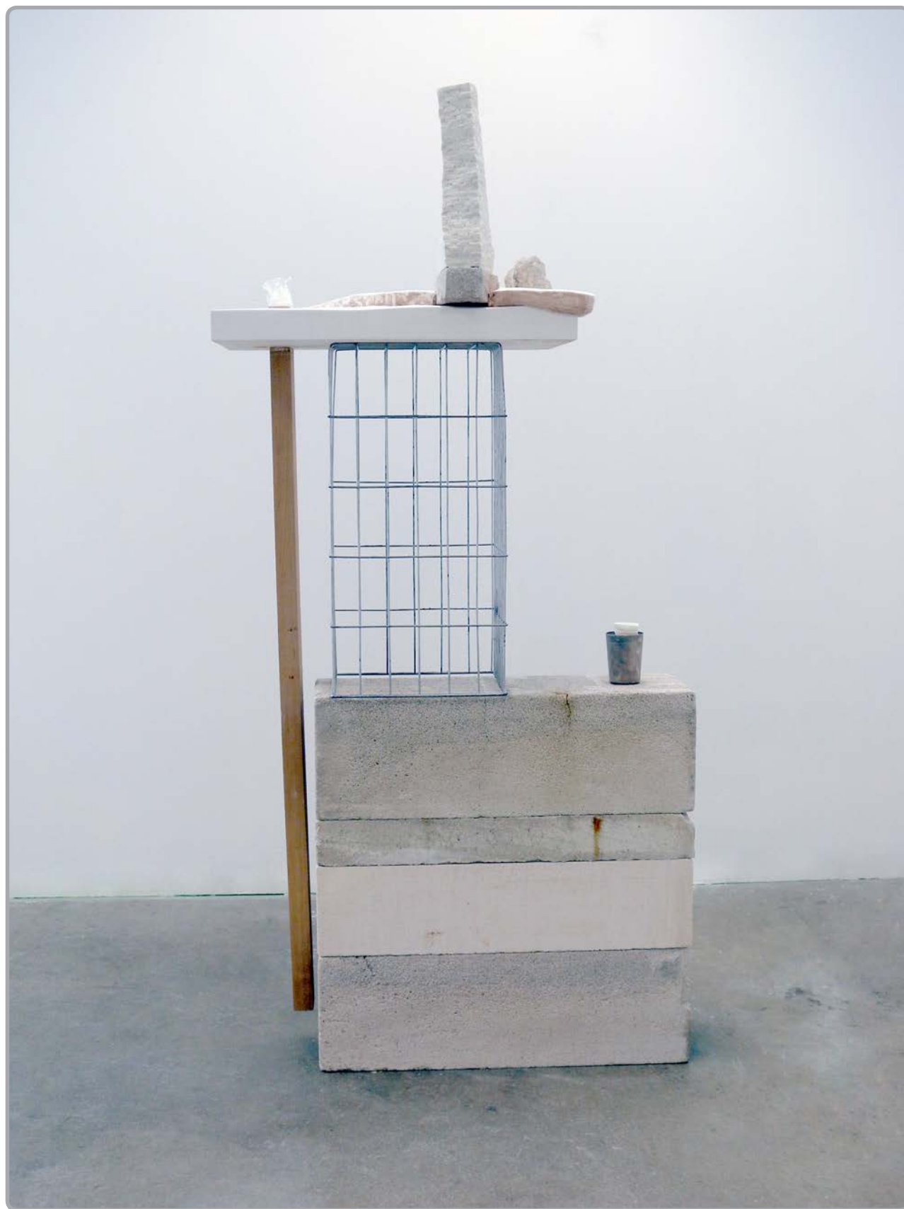
FIGURE 33.1. Christy, The Caged Fox in Winter , 2014. Aerated concrete, porcelain, metal, wood.