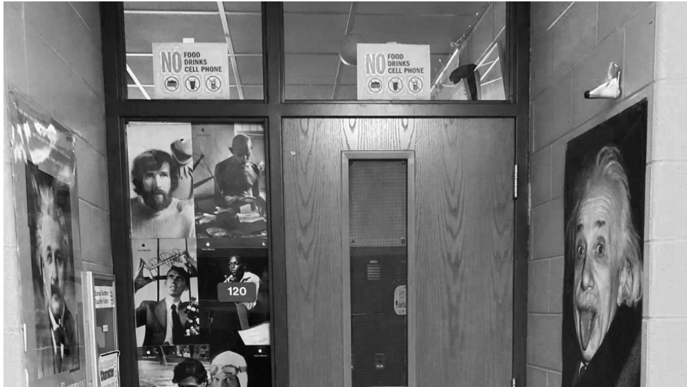
FIGURE 1.1. A collection of mobile device policy signs.

Looking back at these images again, more than a year after summarizing them in the original blog post, I am still dismayed. With demands like “Cell phones must be turned off and put away before entering my classroom” and the simpler “No Phones Ever!” shouting at students, it is clear the teachers in these classrooms are positioning themselves as arbiters of power and that phones are disruptions to the natural order of things. This is but one series of snapshots, and I am not going to go into a full discursive analysis of what each of these messages mean as well as the inherent power dynamics that happen in American high schools. That is a sociological and psychological conversation far beyond the scope of my work, though I strongly encourage readers to explore these dynamics through the work of many educational critics, including John Taylor Gatto (2005, 2008), Alfie Kohn (1993, 2000), and others noted throughout this book.