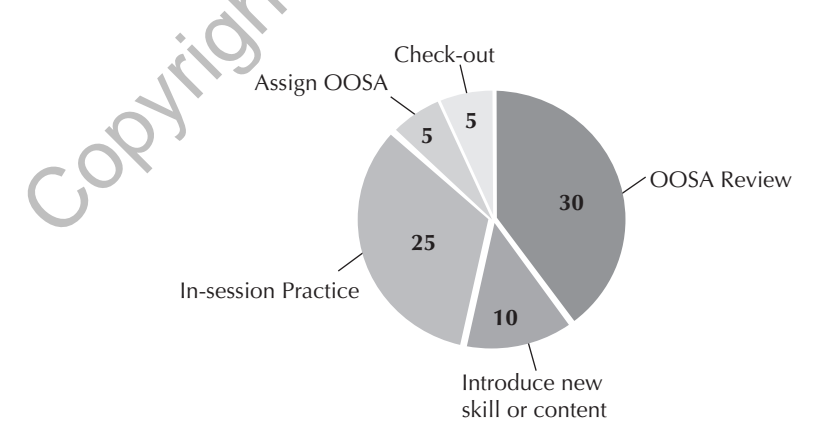
FIGURE 2. Pacing of CBCT for PTSD sessions beginning with Session 2 (numbers indicate minutes).

A key to delivering manualized therapies successfully, in general, is pacing the delivery of interventions within each session. After the first session, in which the therapist speaks relatively more compared with future sessions in order to provide psychoeducation about the symptoms of PTSD in an interpersonal context and the rationale for the therapy, the therapist is urged to consider the following suggested time frames in pacing each of the 75-minute therapy sessions (see Figure 2). Approximately 30 minutes should be spent reviewing the couple's out-of-session assignment (OOSA) and/or troubleshooting difficulties in completing the OOSAs. Approximately 10 minutes is then spent teaching new skills or introducing specific content, depending on the session. Consistent with the importance of experiential exercises in couple/family therapies, we suggest that approximately 25 minutes of the session be spent practicing the new skill or focusing the couple on interacting about the new content introduced in the session. The balance of the session is spent introducing the next OOSA to the couple (approximately 5 minutes) and doing a check-out (approximately 5 minutes) from the session. The check-out consists of inquiring of the couple what they took from the session, reinforcing any learning that the therapist observed in the session, and emotionally containing or sending the couple out on a positive note as they leave the session.