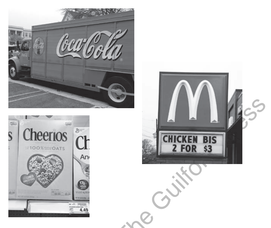
FIGURE 2.2. Examples of environmental print that children may use to begin the process of learning to read.

to a piece of environmental print and then pull apart the constituent pieces of the logo (e.g., pointing out the M in the MacDonald's sign), so that the child can begin to discern the relevance of the various parts. Sometimes this type of interaction around print will lead to informal letter instruction by the adult, who continues the interaction by supplying a letter name or sound to go with the print. Thus, adults will sometimes begin to support children's early acquisition of letter names and sounds directly through environmental print. How regularly this actually happens is unclear, and it probably varies from family to family. Purcell-Gates (1996) has suggested that, without this additional adult scaffolding, children may not be able to profit from this exposure to environmental print to begin specific early literacy learning.