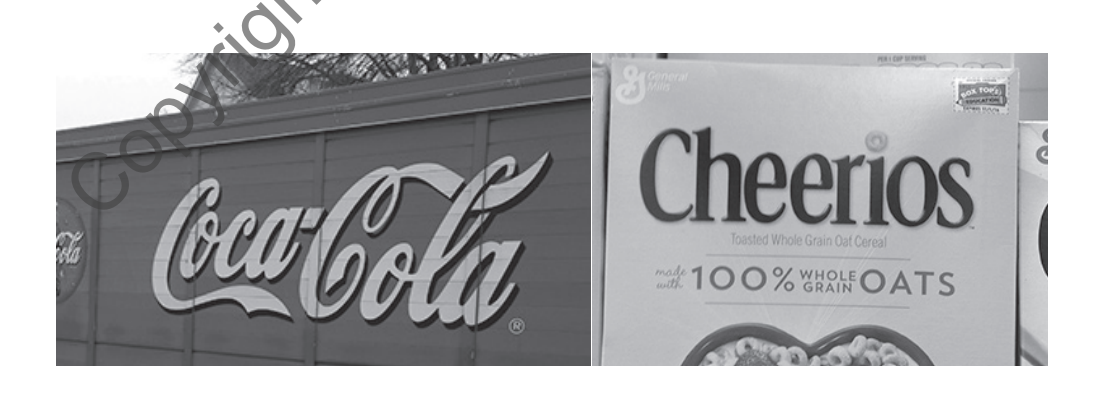
FIGURE 8.1. Adults can point out how the words Coca-Cola and Cheerios each have the letters C and o .

A cynic might ask, "Why don't these families just take their children to the library?" Public libraries are not a direct replacement for having a home library filled with books. Library branches in low-income neighborhoods generally contain fewer titles overall, and often have less working-family friendly hours compared to those in more affluent neighborhoods (Krashen, 1995). Fines levied for